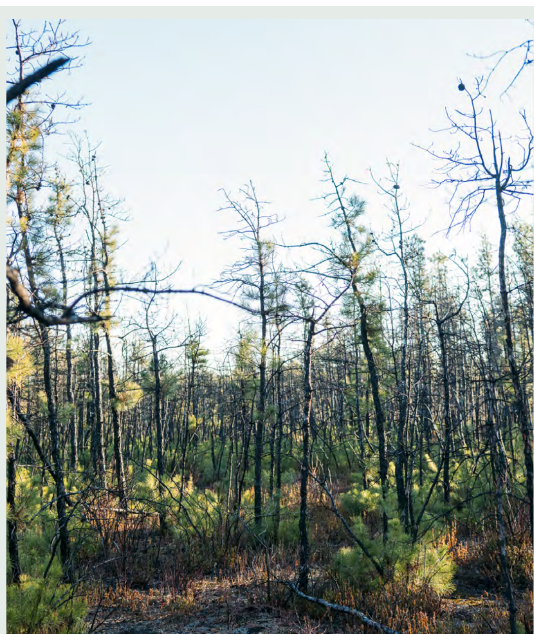
Atsion Burn Natural Heritage Priority Site

Additionally, the Department of Environmental Protection’s Endangered and Nongame Species Program assisted with outlining sites that include significant habitats for rare animals. These sites are of top priority for the preservation of biological diversity in New Jersey.