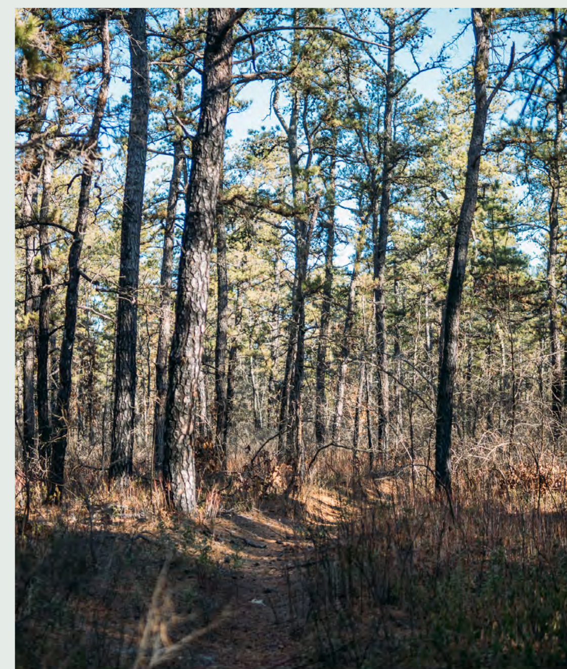
Former Agriculture - Near Carranza Rd